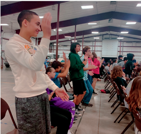
Pictured is K-10 and our teaching staff